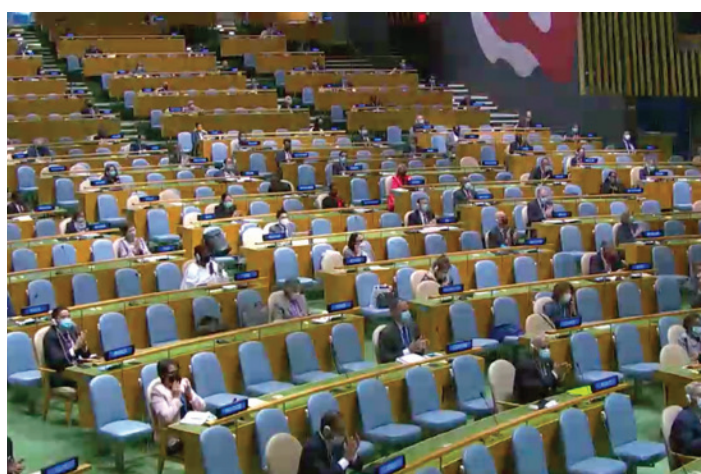
Above: The GA Hall on Oct. 22. Right: Slovakian President Zuzanna Caputova of Slovakia, the first female leader to speak after 50 male leaders.

UN Secretary General Antonio Guterres urged that all countries “must be guided by science and tethered to reality” while confronting the COVID-19 pandemic crisis. He also pointed out how women are disproportionately represented in the sectors hit hardest by job losses; doing the unpaid care work generated the pandemic, lack of economic resources and access to benefits. He highlighted the impact of the pandemic on millions of young girls—they are losing their chance for an education and a future as schools close.